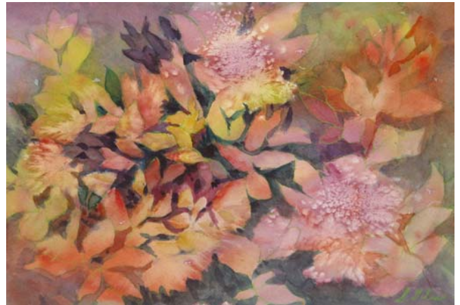
First Place “Leaf Color Riot” watercolor Sharon Giles