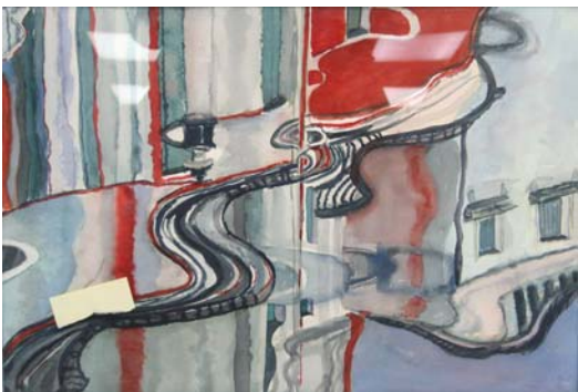
“Reflections of Burano”