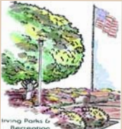
Irving Parks & Recreation Irving Parks & Recreation

Asel art supply providing quality art materials at reasonable prices www.aselart.com