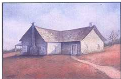
Aunt Mag's House