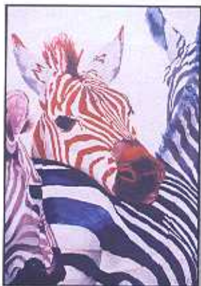
What Color Are Your Stripes