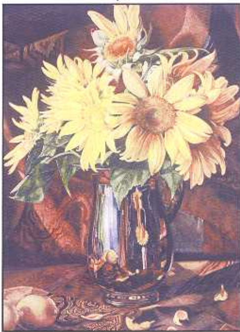
Soon Y. Warren Fort Worth, Texas "Sunflowers" Watercolor 36x28