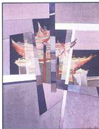
Oriental Digression #3