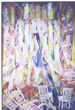
Need to Embrace