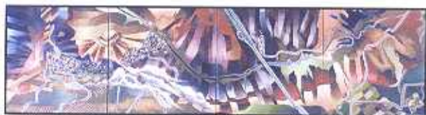
Transitions 1: Early Spring