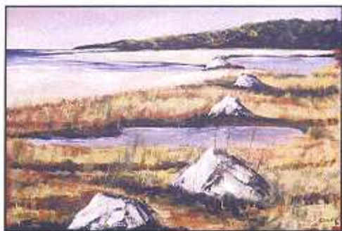
Low Tide, Cape Cod

Jim Seigler Houston, Texas "Low Tide, Cape Cod" Mixed Acrylic/Pastel 24x36